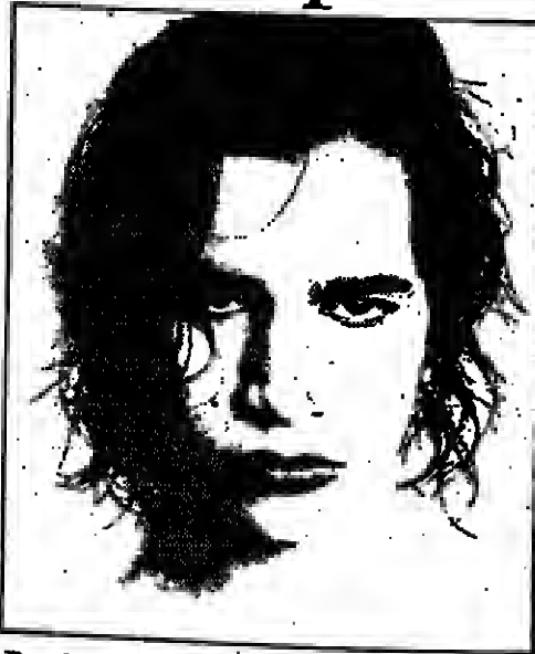
Pop idol Aviv Geffen.